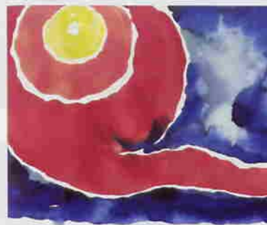
O'Keeffe and Texas